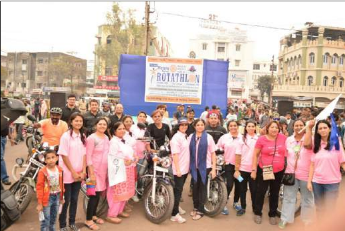
ROTATHLON - BICYCLE RALLY