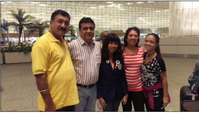
INCOMING & OUTGOING RYE STUDENTS