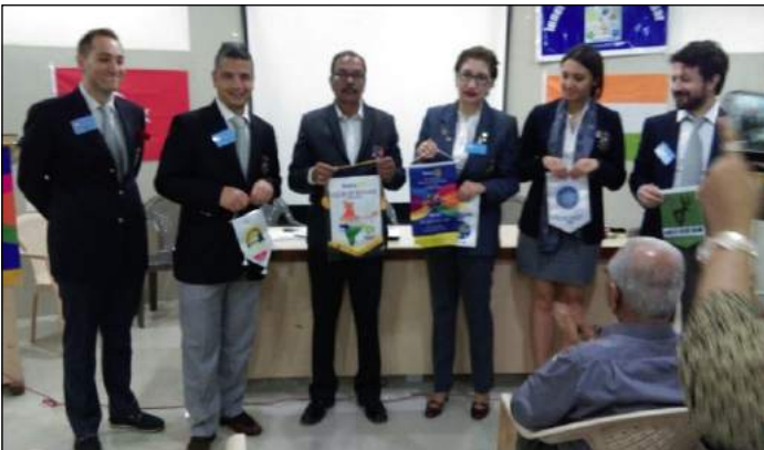
GSE TEAM FROM TURKEY