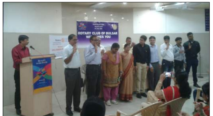
INDUCTION OF NEW MEMBERS