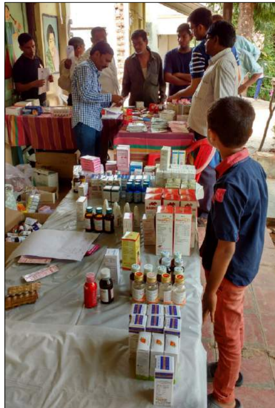
MEDICAL/ HEALTH CHECK UP CAMP AT ATAK PARDI SCHOOL.