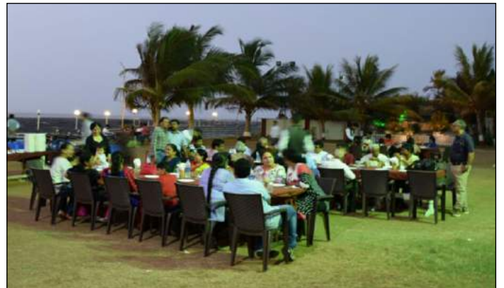
ROTARY FAMILY PICNIC TO DAMAN