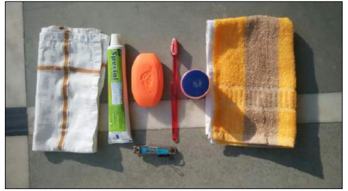
WINS PROGRAMME - KITS DISTRIBUTION TO STUDENTS OF ATAK PARDI SCHOOL