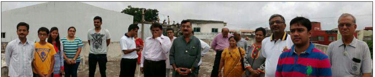
FLAG HOISTING AT ROTARY HALL