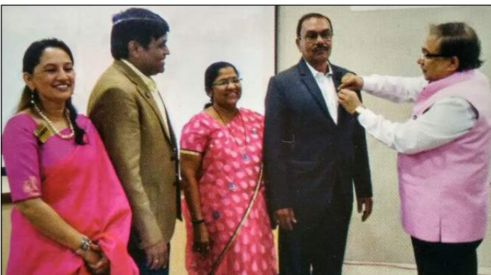
ROTARY FOUNDATION - MAJOR DONOR