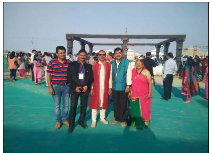
DISTRICT CONFERENCE 'RANN MAITRI' AT BHUJ